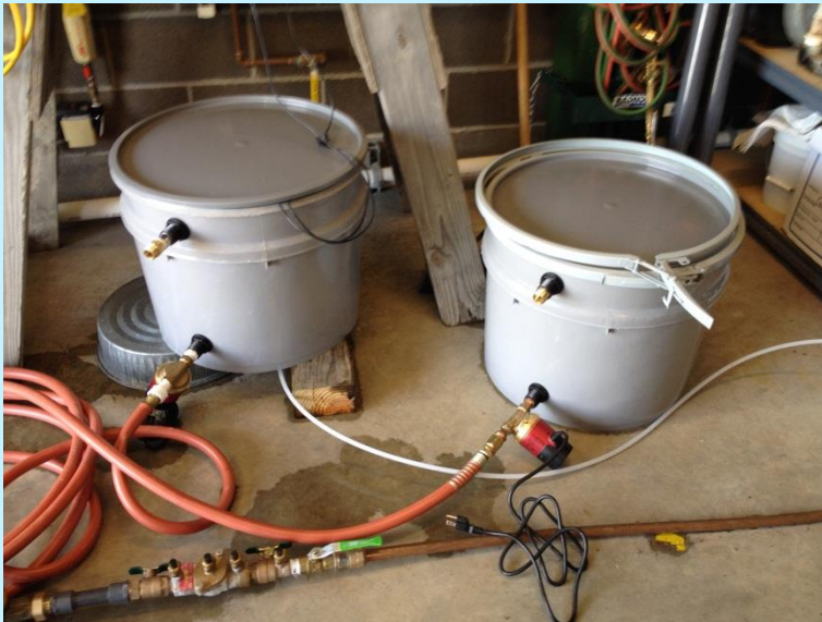
Dissolved Oxygen Containers