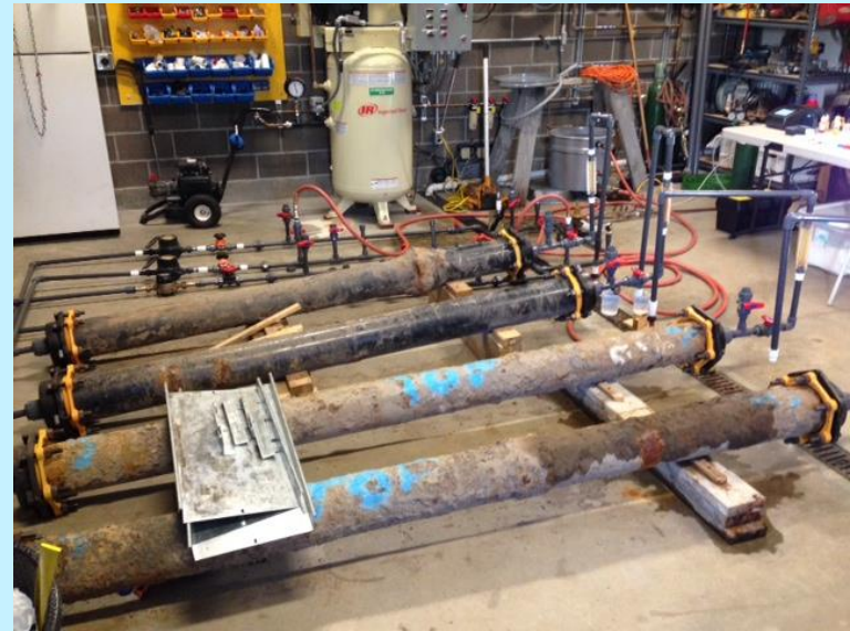
Pipe Rigs and Injection Piping